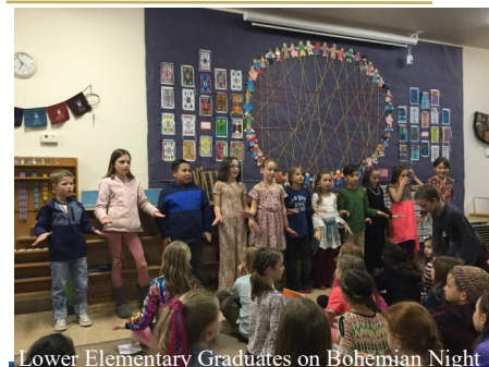
Lower Elementary Graduates on Bohemian Night