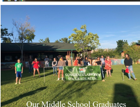
Our Middle School Graduates