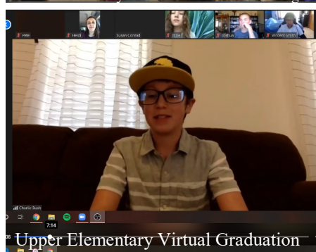
Upper Elementary Virtual Graduation